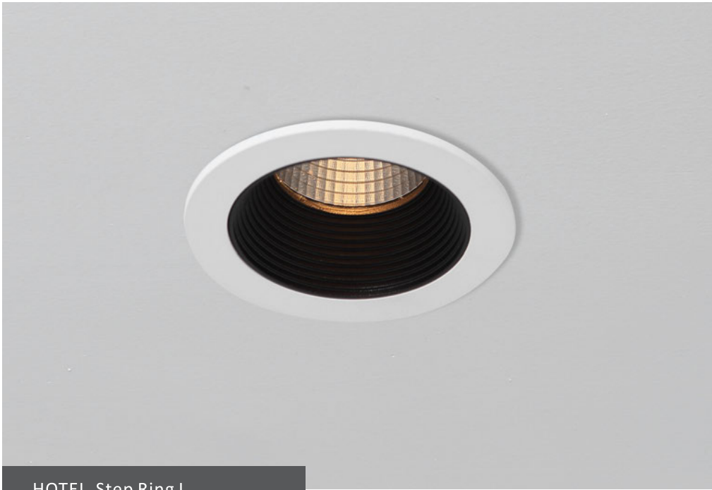
HOTEL Step Ring L